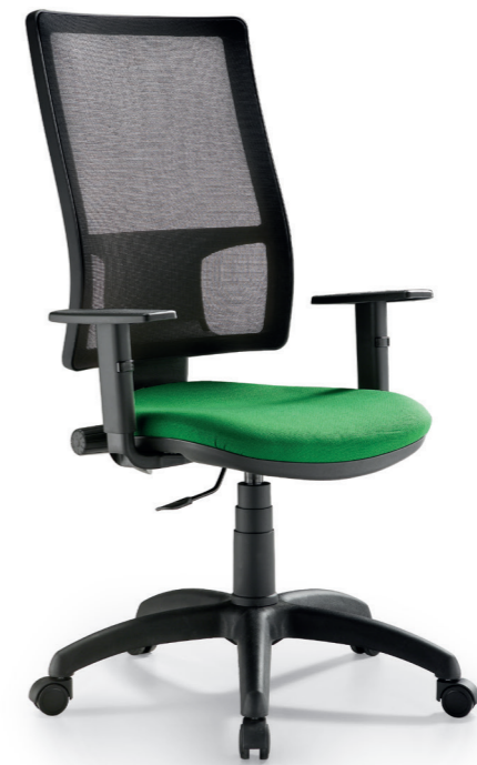
WING OPERATIVE CHAIR