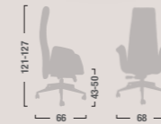
LD11 Poltrona presidenziale con braccioli e oscillante mov. 19. Presidential armchair with mov. 19 tilting.